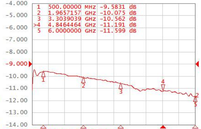
Tr2 S21 Log Mag 1.000dB/ Ref -9.000dB [F2]