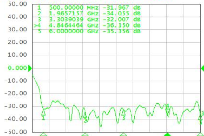
Tr3 S21 Log Mag 10.00dB/ Ref 0.000dB [F2 Smo]